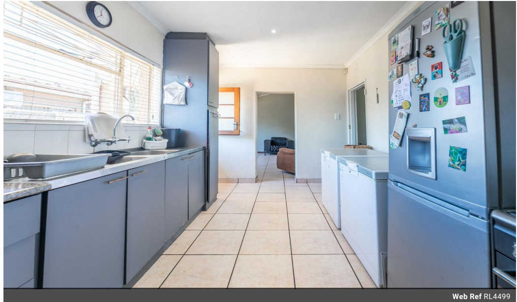
Web Ref RL4499