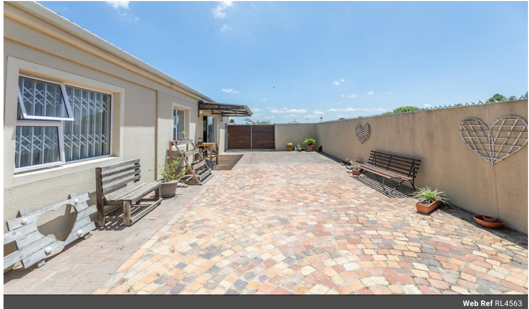
Web Ref RL4563