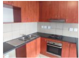
Web Ref RL2219